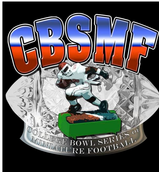
The bold logos of the College Bowl Series of Miniature Football